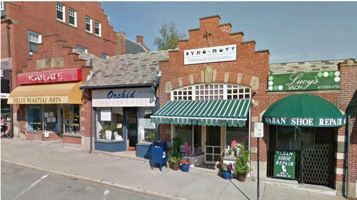
Left to right: Nos. 1639, 1637, and 1635 Beacon Street, from July 2017 Street View image. Stairs to right of No. 1635 go to Nos. 1637a and 1635a on the basement level.