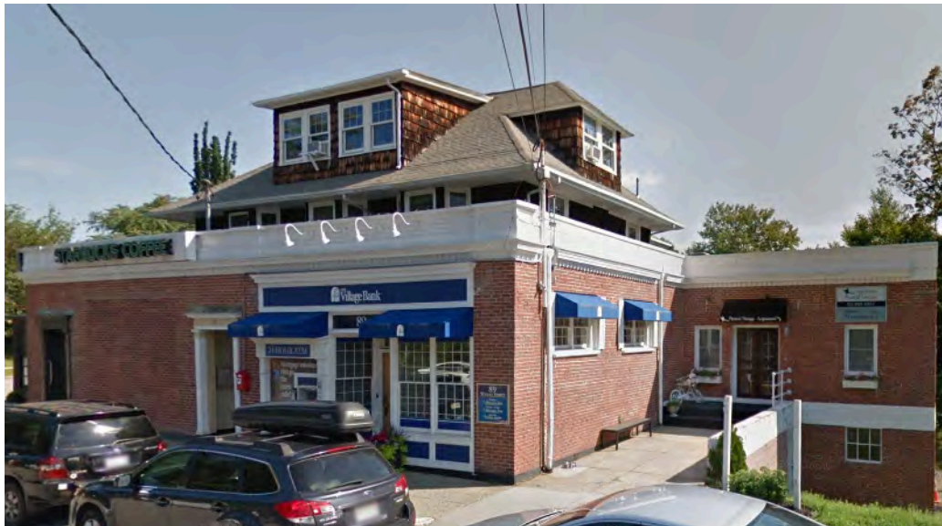
Former Waban Hall building, and extensions, Nos. 87 (right) and 89 (left) Wyman Street, from August 2019 Street View image.