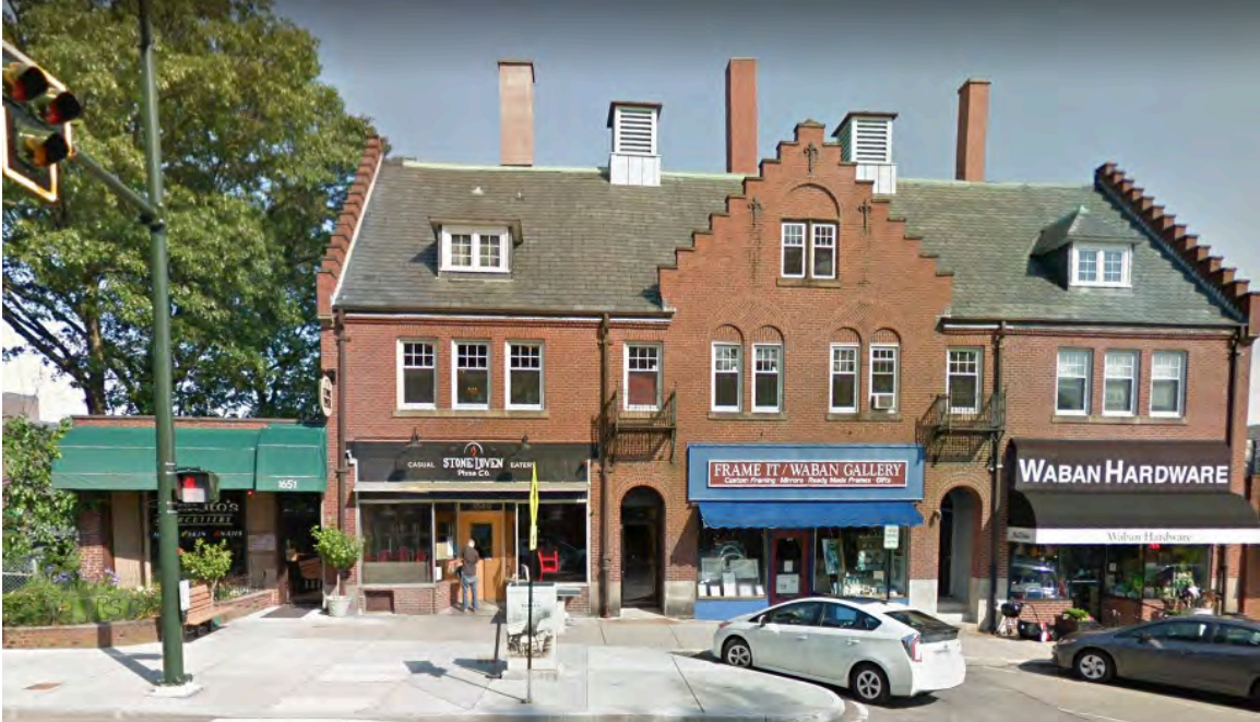
Left to right: Nos. 1651, 1649, 1645, and 1641 Beacon Street, from July 2017 Street View image. Doorways on either side of No. 1645 go to stairs to second floor, Nos. 1647 and 1643.