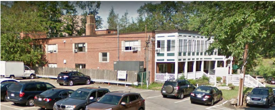
20 Kinmonth Road, from July 2017 Street View image.