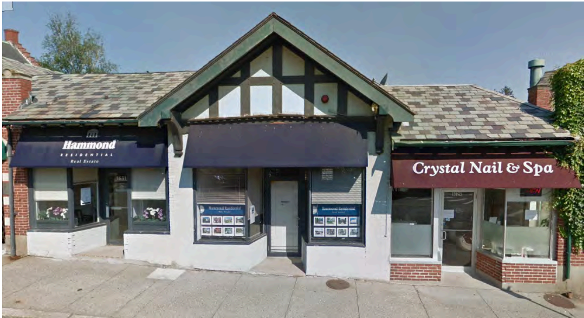
Left to right: Nos. 1633, 1631, and 1629 Beacon Street, from July 2017 Street View image.