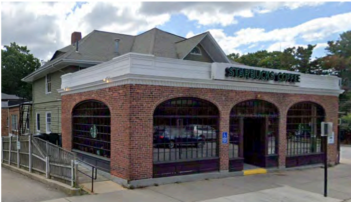
Former Waban Hall building and Woodward Street extensions, No. 474 Woodward. Left end is former No. 472 Woodward. Right end is former No. 476 Woodward. From September 2019 Street View image.