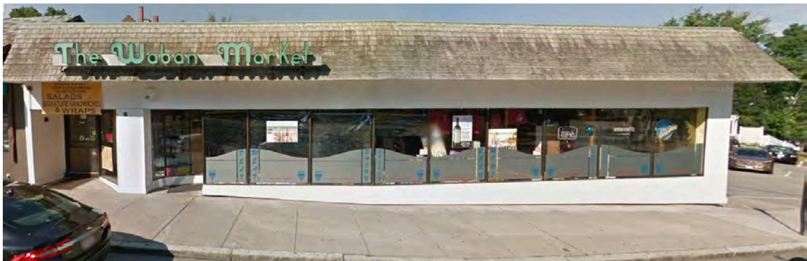
No. 10 Windsor Road, from July 2017 Street View image. Includes former No. 8 at left end and former No. 12 at right end.