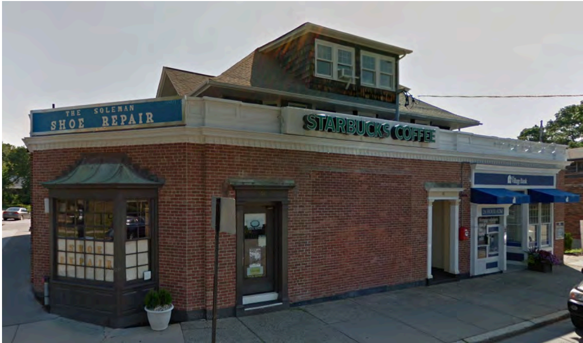
Former Waban Hall building and Wyman Street extensions. From right to left No. 89 Wyman St.; entry to stairs to upper level (No. 91); bricked-over storefront of former No. 93; No. 95. From July 2017 Street View image.