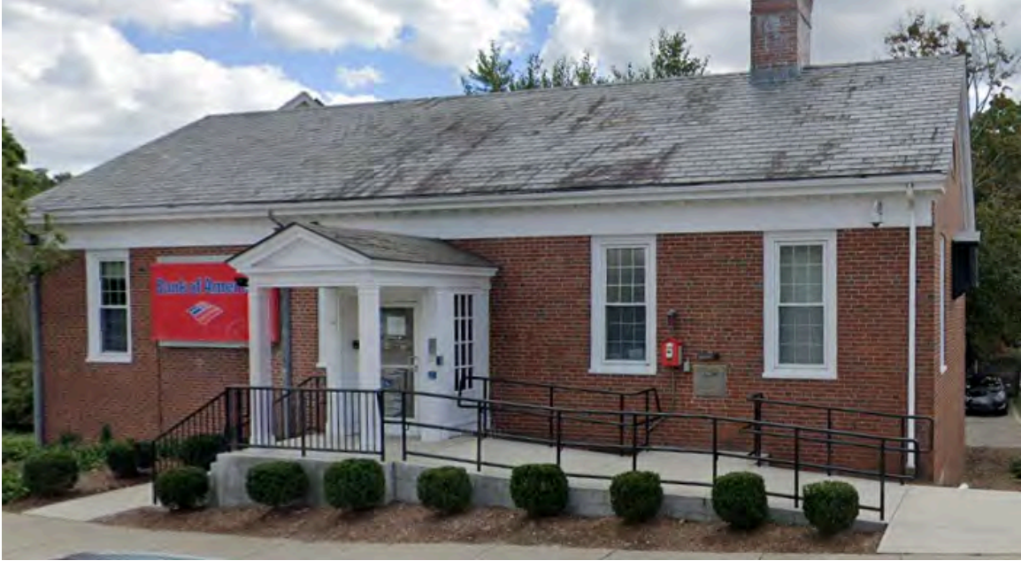
No. 466 Woodward Street, from September 2019 Street View image.