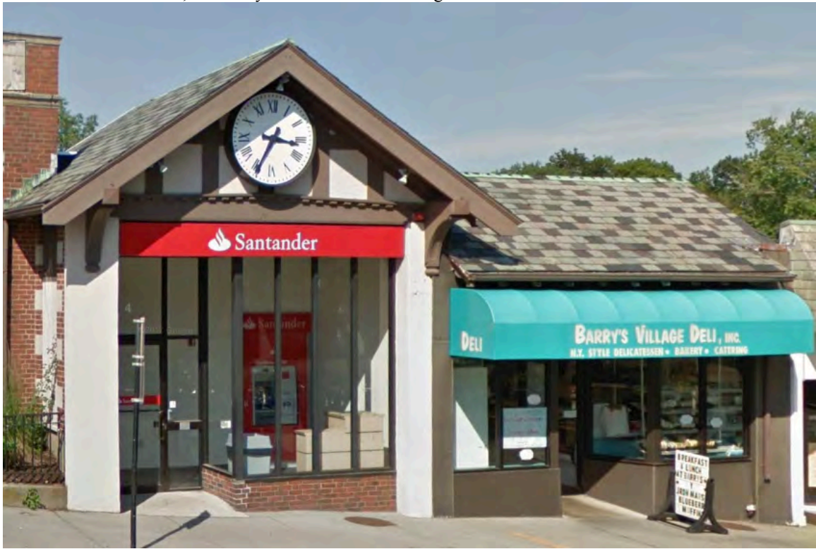
Left to right: Nos. 4 and 6 Windsor Road, from July 2017 Street View image.