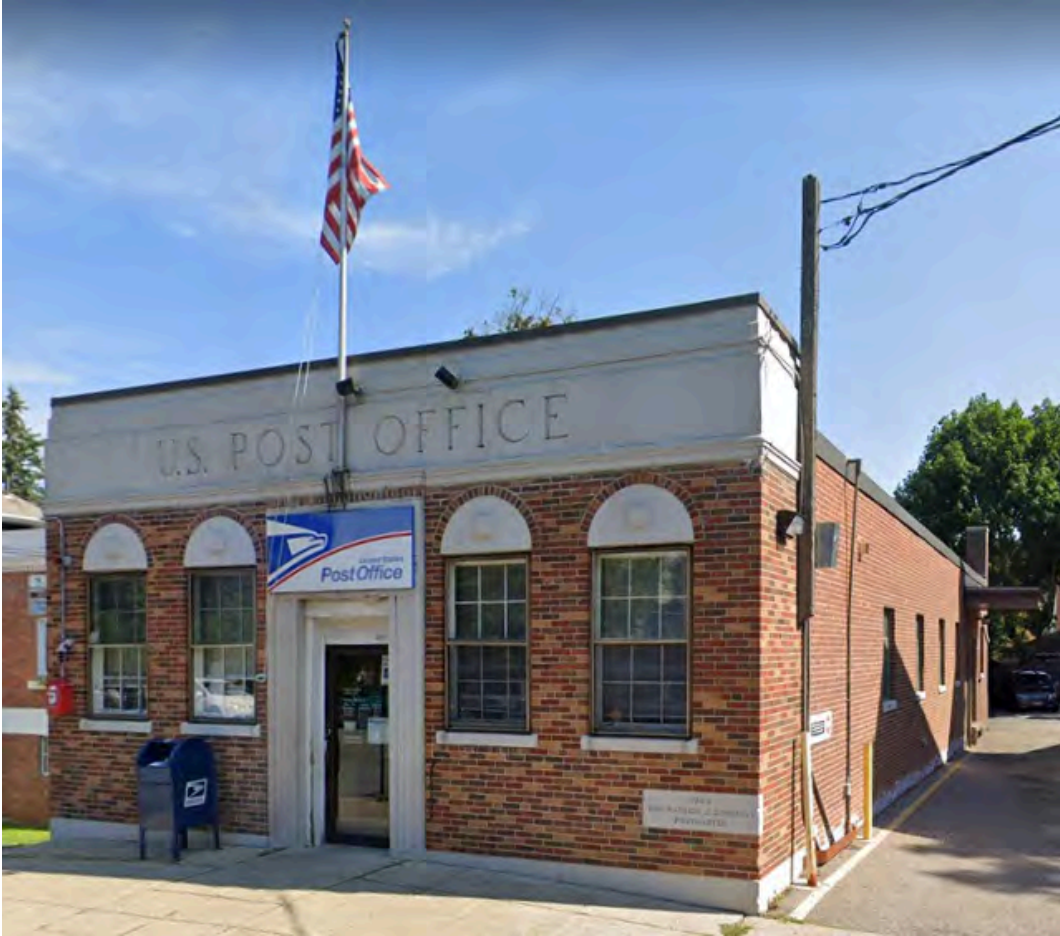
Waban Branch Post Office, 83 Wyman Street, from August 2019 Street View image.